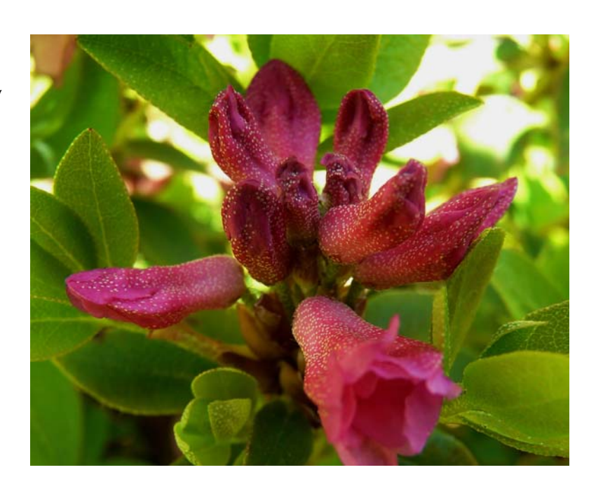
Ann's "Morning Bud" was second in its class.

Ann Allen's "Red with Scales" was first in the Color 5 X 7 Print category