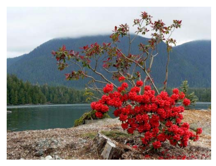
"Tofino Red" by Ann Allen was second in the Garden Scene category. The Murrays' "Windswept" (see page 4) was first.