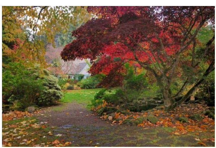
Susan Lightburn's "Fall in Garden" was third in the Garden Scene category.