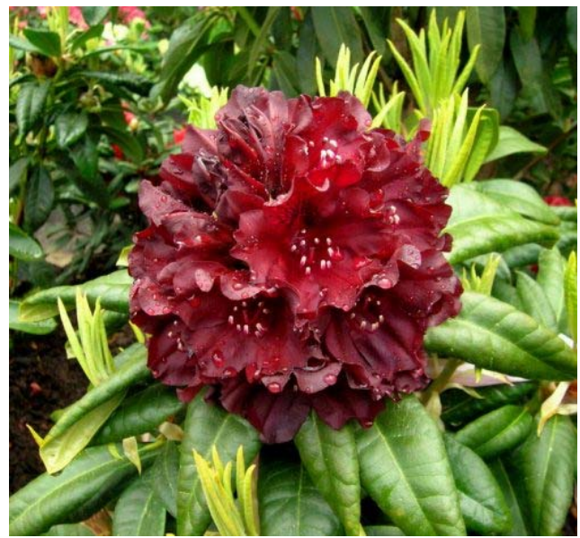
Norma Senn's R. "Black Widow" was first in the Single Truss category.